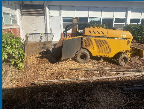
Stump Grinder for Existing Trees