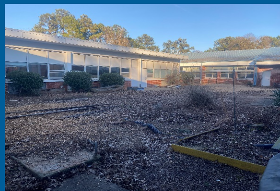
Trees Demolished at Courtyards