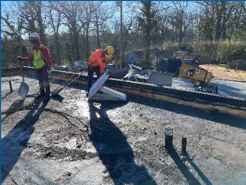
Demolition of Existing Roofing