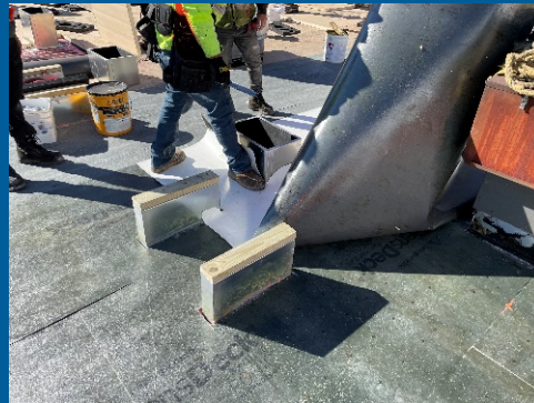
Installation of New TPO Roofing and HVAC Curbs