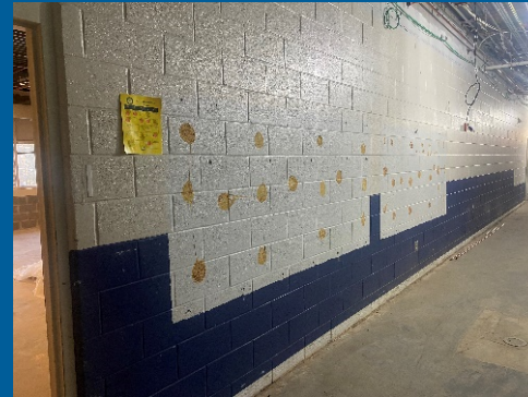
Demolition of Markerboards & Tackboards Throughout