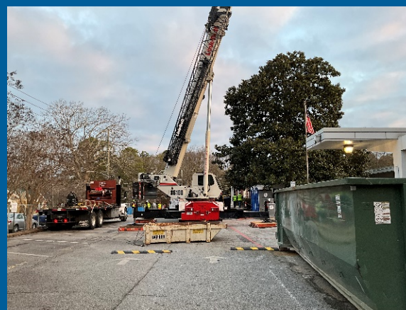
Crane used to Hoist Demolished Tree from Courtyard